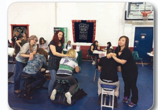
Participants take part in chair massages