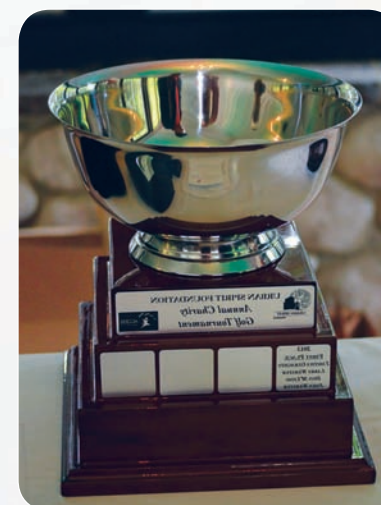
First place team trophy.

A third annual tournament is planned for Friday, June 26 at Country Meadows. We anticipate even greater success at that tournament which is one of USF's largest fundraisers of the year.