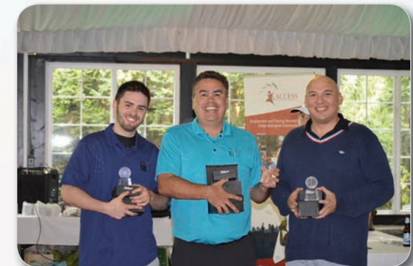
The 2nd Annual Charity Golf Tournament was won by New Relationship Trust team.