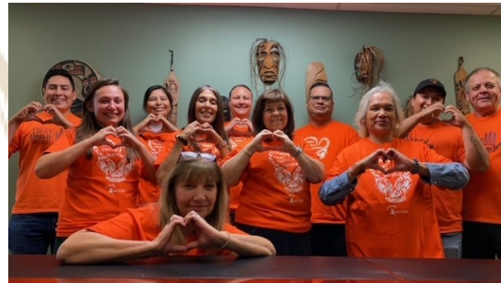
ACCESS Head office staff