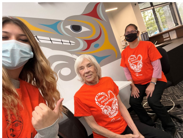
ACCESS Surrey office staff