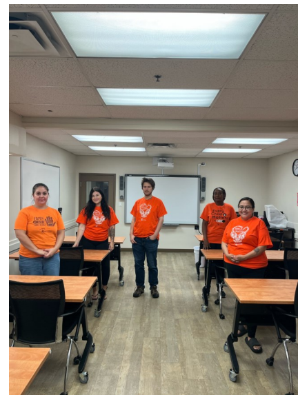
Essential Skills New Westminster office