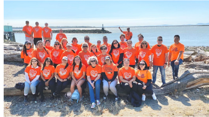
ACCESS staff wearing their Orange shirts