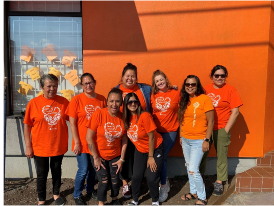
ACCESS Employment Assistance Services office

ACCESS and Urban Spirit Foundation staff wore their Orange shirts on September 30th to honour all the children who attended residential school.