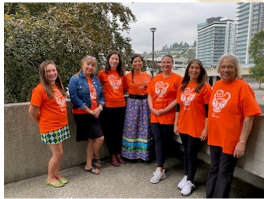
ACCESS Head office ladies