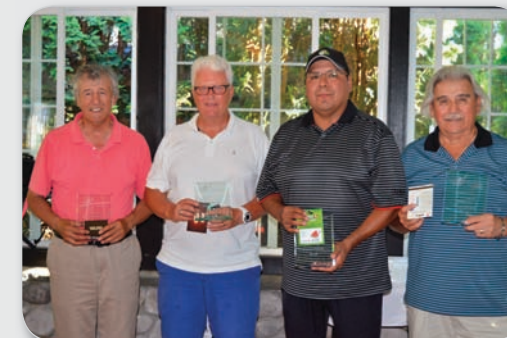
The 3rd Annual Charity Golf Tournament won by the ACCESS team and on the right the 2nd place winners were from one of the Vancouver Native Health Society teams.

A fourth annual tournament is planned for Friday, July 8, 2016 at Country Meadows. We anticipate even greater success at that tournament which is one of USF's largest fundraisers of the year.