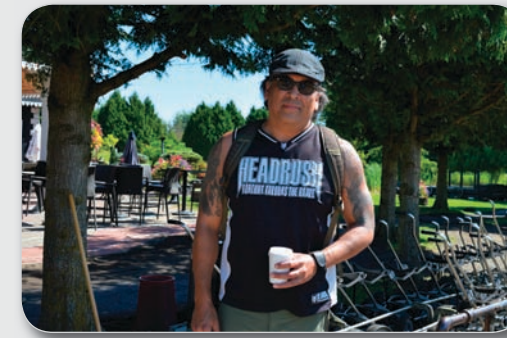
Eric Schweig of APTN's Blackstone and the keynote speaker getting ready to golf